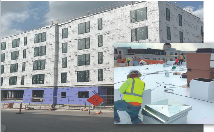
The main structure of Restoring Waters is complete—now Ryan Companies is working on installing windows, staircases, electrical systems and more.

We are elated to share that the construction is over halfway done! If you visit the Highland Bridge neighborhood you can now see all five stories of Restoring Waters on the corner of Woodlawn Ave. and Mt. Curve Blvd. Restoring Waters will provide truly transformational housing and healing to 60+ women, individuals, and small families in the innovative Highland Bridge development in Saint Paul. This building will provide a welcoming environment through trauma-informed principles and healing design to promote calm, safety, dignity, empowerment, and well-being for all who live and work there.